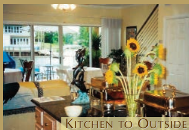
KITCHEN TO OUTSIDE